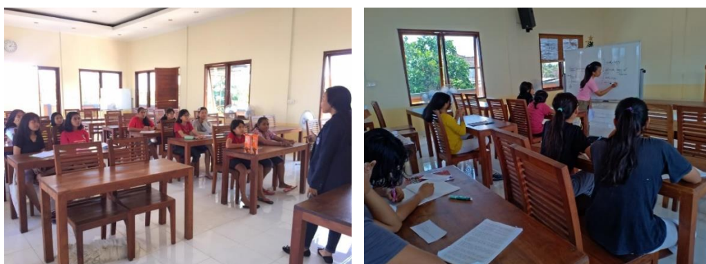
Figure 2. Learning Process