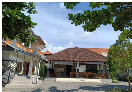
Figure 1. Sekar Pengharapan Orphanage

Sekar Pengharapan Orphanage is located on Jalan Veteran, Buduk, Mengwi, Badung, Bali. This orphanage was established in 2010 and started operating in 2011. It was built by Koreans and assisted by three officers in the administration, spirituality, and consumption sectors. There are 11 rooms in this orphanage, such as office, study room, library, kitchen and dining room, place of worship, seven bedrooms for children and officers. Nowadays, there are fifteen children in this orphanage. It consists of one child in elementary school, four children in junior high school, six children in senior high school, three children in university, and one child who will continue her studies in the university next year.