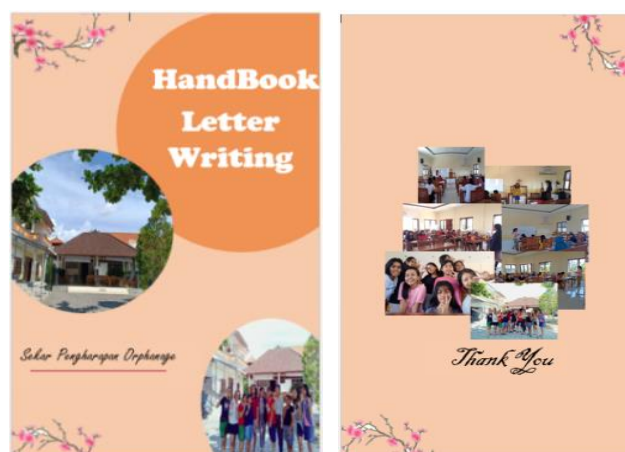
Figure 4. Front and Back Cover of Handbook