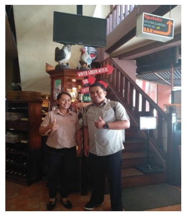
Figure 1. Mama's German Restaurant with Supervisor Operational

In the process of depth-interview found that communication in English was really needed to the staffs that works in Mama's German Restaurant. Communication that needed was speaking and listening. At the last of interview the staff and supervisor answered their needs in English course.