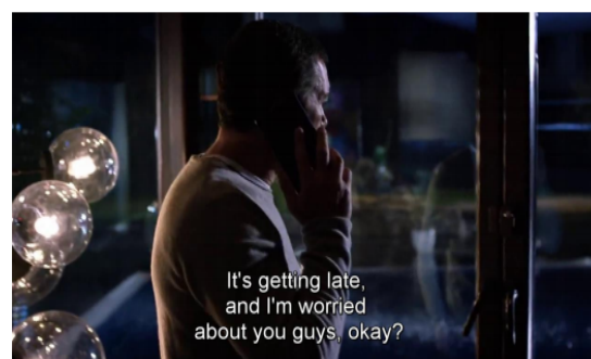
Picture 1. Frank was scared and worried about his Family

Setting : Place : At talent show place Time : At the midnight