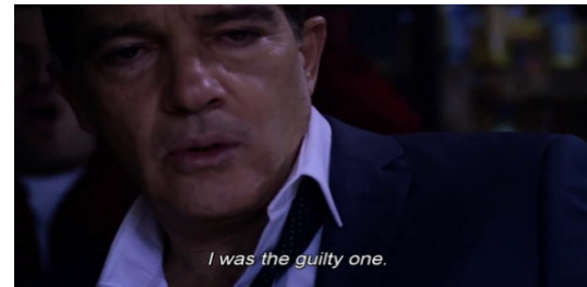
Picture 2. Frank felt Sadness and Guilty for the Death of his Family

The picture above shows that Frank looks sadness because he gets bad news from the police who found his wife and his daughter dead. How quickly the loved one disappeared that made frank sad. This conflict happened at a crime scene in the film when Frank was asked to recognize his family's corpses. Since that incident, he always remembers his family and feeling guilty for the death of his family. The struggle between inside Frank's mind presented in the dialogue bellow: