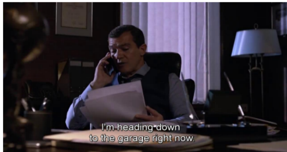
Picture 3. Conflict between Frank and Sue

Setting: Place: At Frank's lawyer's office. Time: In the afternoon.